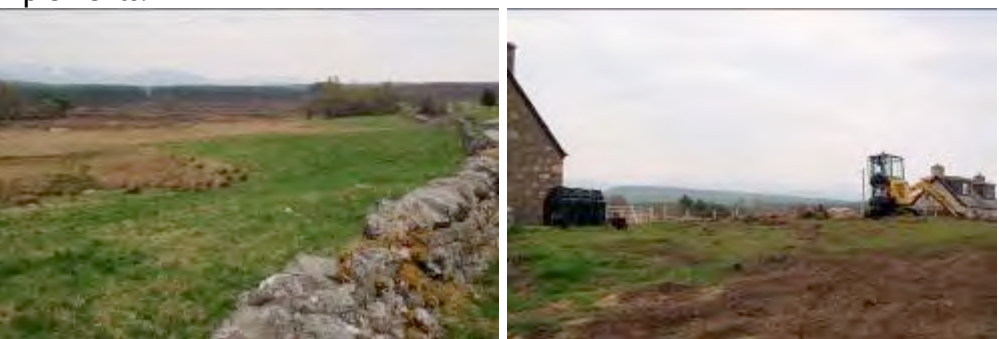
Fig. 5 & 6 -View of croft fields and site area (alt. view)

3. The CNPA Monitoring and Enforcement Officer was alerted that some works had taken place on site in early April 2011, including some tree felling and earthworks. At the time of a site visit by CNPA officials, the site was noted to contain various plant equipment and builders supplies (scaffold, piping and tools) alongside piles of fallen timber. The larger area has recently been cleared of several trees (outwith planning control) and partly excavated. The croft was not subject to any agricultural work but the applicant has intimated that he will build the croft activities up. He further highlights that the existing small barn is not suitable for use for storing tractors and implements.