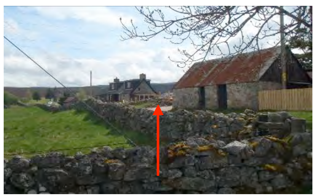
Fig. 2 – Application Site (between neighbouring house and shed)

I. The application site lies within the township of Drumguish, by Kingussie, adjacent to the crossroads of the Feshieway path (core path LBS 83 Badenoch Way) and the public road. It comprises an area of grassland (formerly garden ground but now to be used for agriculture) associated with a cottage known as 'Ashfield.' The cottage and some surrounding agricultural land extending to 2.8ha, within 3 paddocks, has recently been designated as a croft holding (Crofters Commission – ref. no. 441/0054). A number of residential properties are located nearby, mainly to the immediate northwest; while farmland and woodland make up the remainder of its setting.